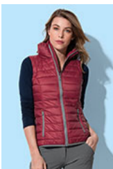
ST5310 Padded Vest