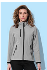
ST5330 Softest Shell Jacket